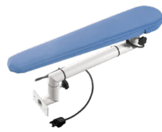
Braccio stiro aspirante Vacuum ironing arm